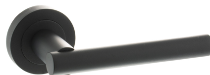
Product Finish Pictured: Matt Black